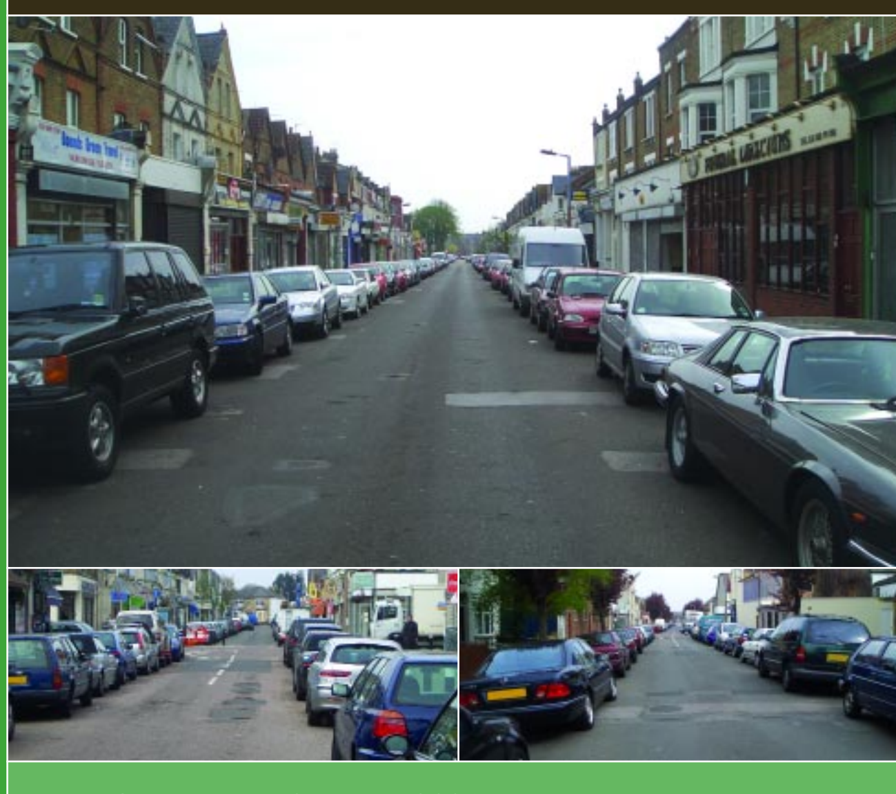
Closing Date 8 August 2006